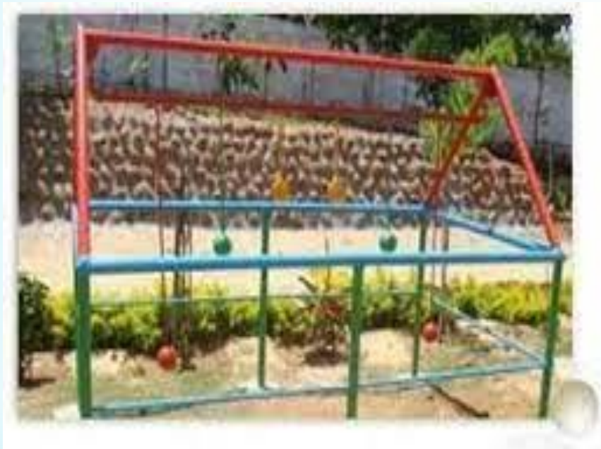
BARTON'S PENDULUM SSSP-38