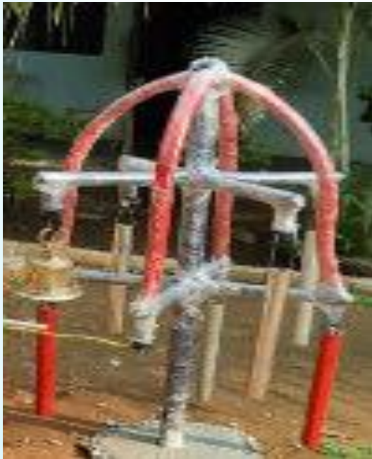
BELL TOWER SSSP-32