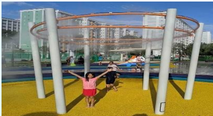
PIN ON KINETICS SSSP-47