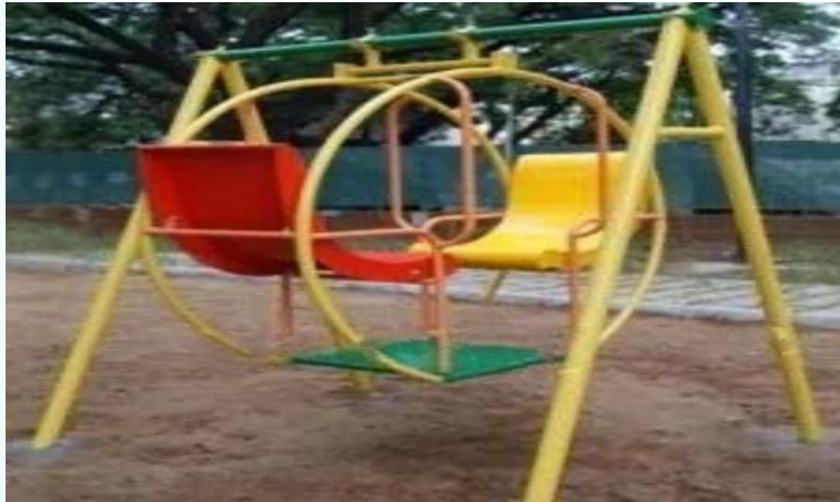
SALEM SWING SSSP-46