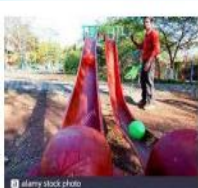
CYCLOIDAL PATH SSSP-40